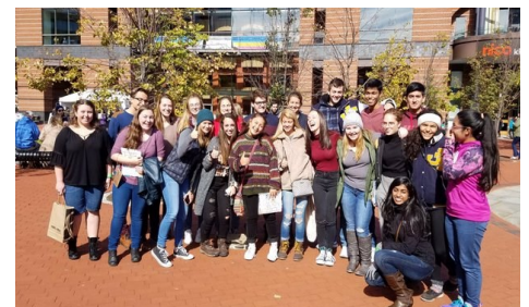
English Students Enjoy The Dodge Poetry Festival at the NJPAC in Newark.

Students in Mrs. Gutwerk's English class are participating in a book tasting. This day is set for students to get a sample of the choice books that will be selected for the socratic book circles. Student's had the opportunity to evaluate the cover, read the summary, read the 1st few pages and then access amazon reviews about each book. Students will use this information to make a choice that interests them. Students will then work collaboratively in literature circles discussing their books.